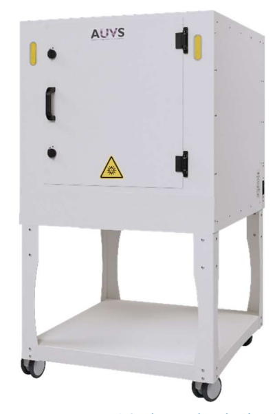
Up to 16 Chromebook-sized laptops can be disinfected in a single 90-second cycle