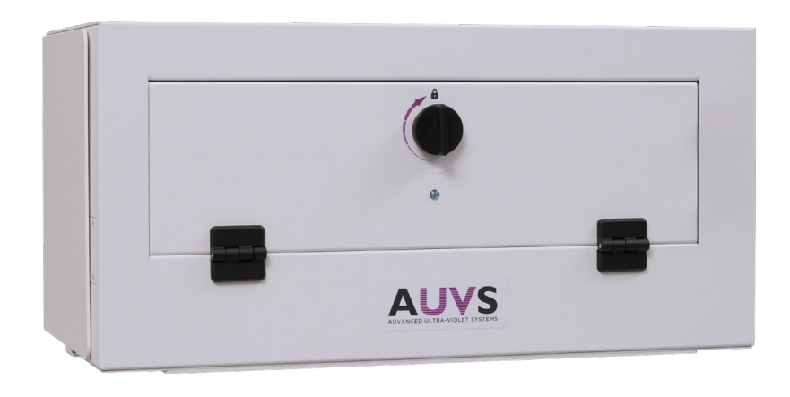
The UV Box is Designed and Built in the USA

In addition to patented, leading-edge technology, The UV Box also uses institutional design principles to withstand demanding, high-volume healthcare environments.